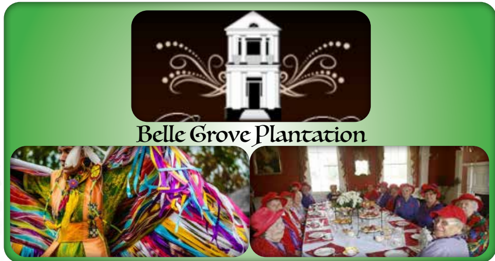
Belle Grove Plantation