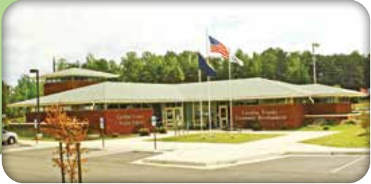
Caroline County Visitor Center