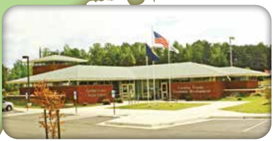
Caroline County Visitor Center